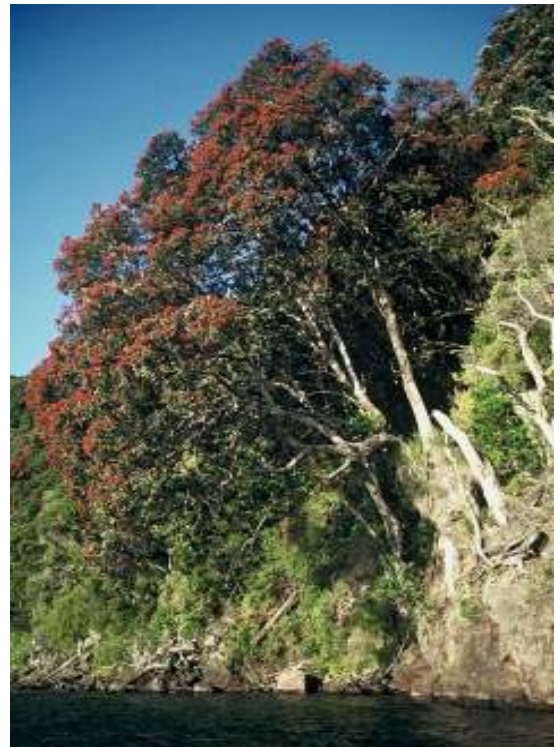
Pohutukawa cling tenaciously to a cliff.

Pohutukawa will grow up to 20 metres high on sheer rock outcrops, and have massive spreading crowns up to 35 metres across. Trees are moulded by coastal winds and to coastal slopes, and spread their weight over unstable ground. Some trees are up to 1,000 years old, and according to Māori the souls of the dead leapt from an ancient Pohutukawa at Te Reinga (North Cape) on their way to the netherworld.